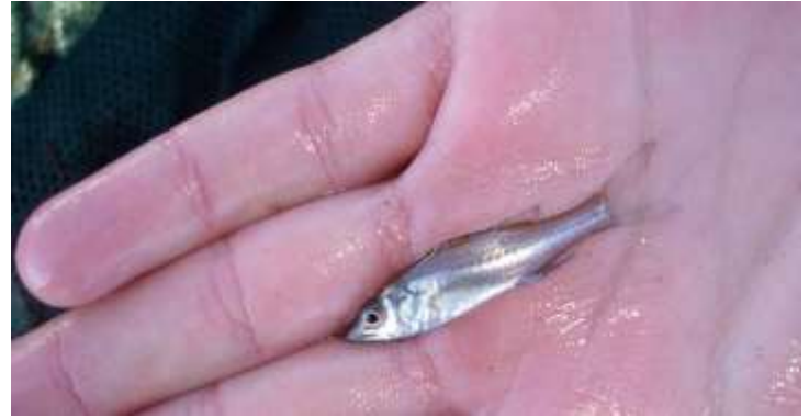
Early-juvenile Common Snook