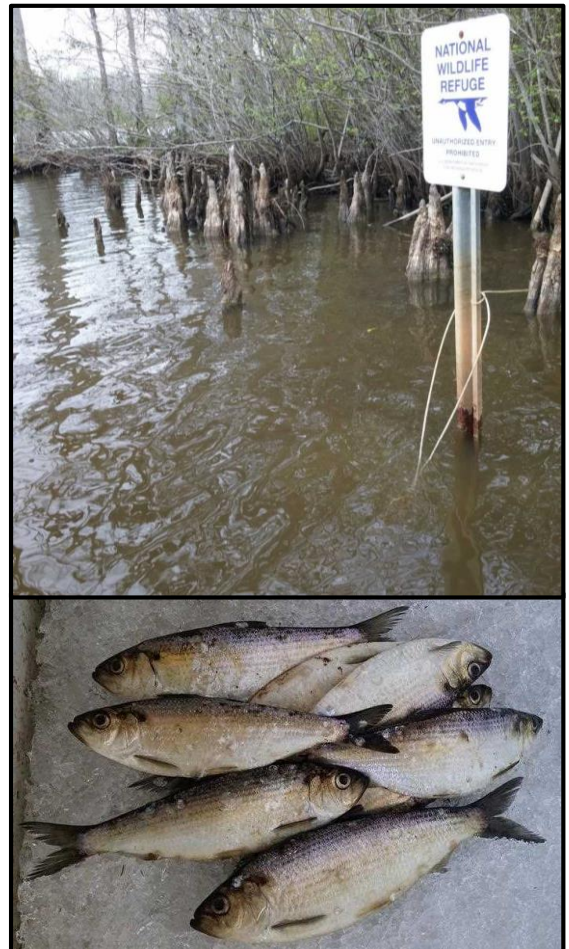
Gillnet set near culvert to collect river herring (top) and river herring samples (bottom).

In order to examine the population issue I worked with the NCDMF and their river herring spawning habitat survey team, which has been monitoring river herring habitat use in the Albemarle Sound since 1973. My main objective was to use their