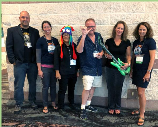
"Monsters of Climate Science"