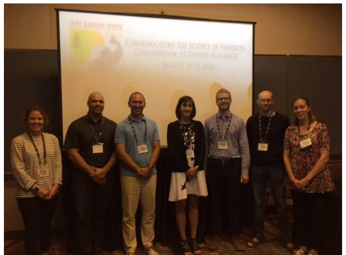
Symposium organizers and some of the speakers.