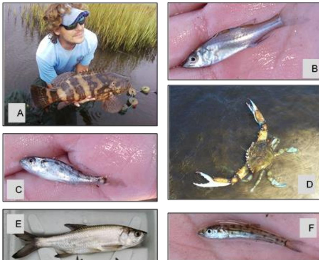
Figure 3: Some of the commercially and recreationally important species collected in Robinson Preserve: A) Goliath Grouper, B) Common Snook, C) Red Drum, D) Blue Crab, E) Atlantic Tarpon, and F) Bonefish

There were also fewer non-native species in the preserve. Densities of focal fish species were often higher in Robinson Preserve than in the reference data sets. Of the species identified as targets for restoration and land acquisition by the Tampa Bay National Estuary Program