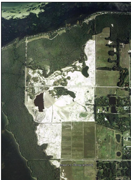
Figure 1: Robinson Preserve pre-restoration, 2002.