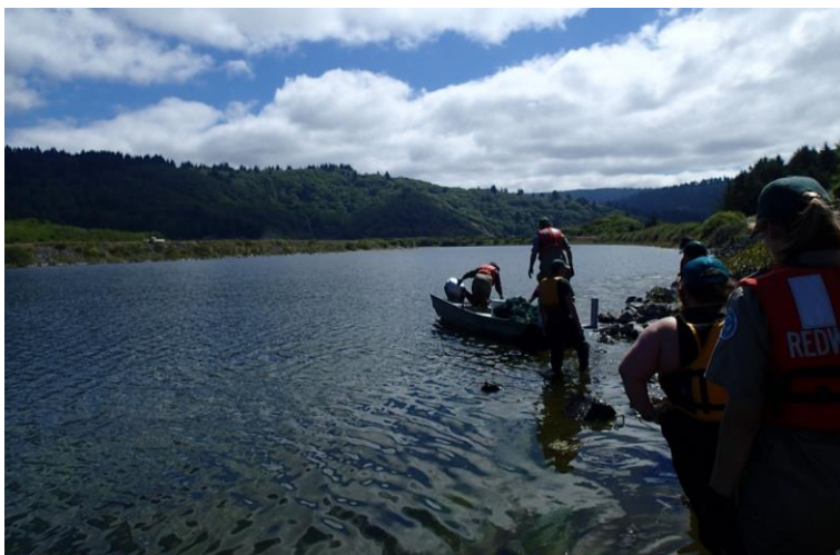
Juvenile Chinook Salmon sampling in Redwood Creek, CA.

Currently, I am working with restorationists at NOAA and the National Park Service on developing models and restoration scenarios. The California Cooperative Research Unit and my next step are to develop a bioenergetics growth model that evaluates growth under various flow regimes. Ultimately understanding how restoring the system may influence the natural processes and juvenile salmonid growth is critical to developing the most successful restoration project for juvenile salmon in Redwood Creek.