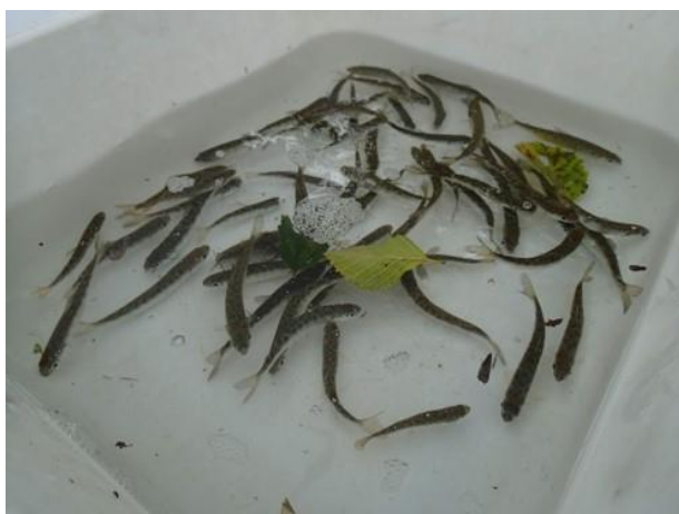
Juvenile Chinook Salmon